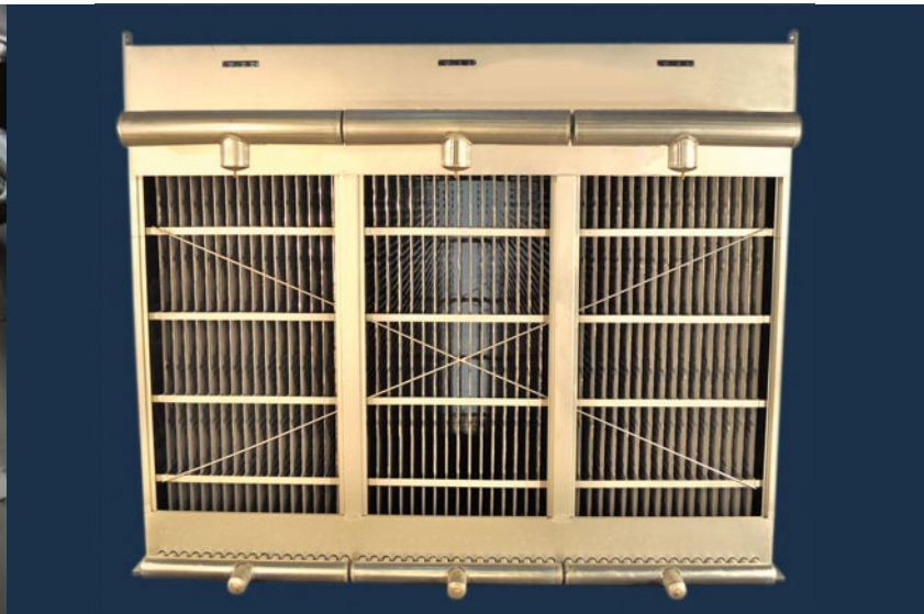
PIC LEFT ice silos with 5000 kWh storage capacity each PIC RIGHT ice maker for 6 to/h. At 10 h buildup time 5600 kWh