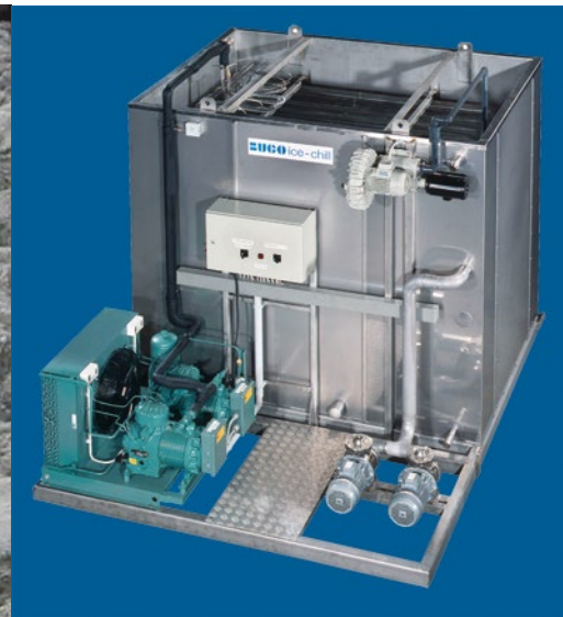
PIC (LEFT TO RIGHT): Panelsystems in a tank, with air agitation to increase heat transfer and reduce fouling effects; Ready to plug cooling system with refrigeration units: (up to 20 kW)