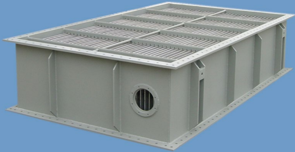
PIC: Panelsystems in flow channels for waste air heat recovery