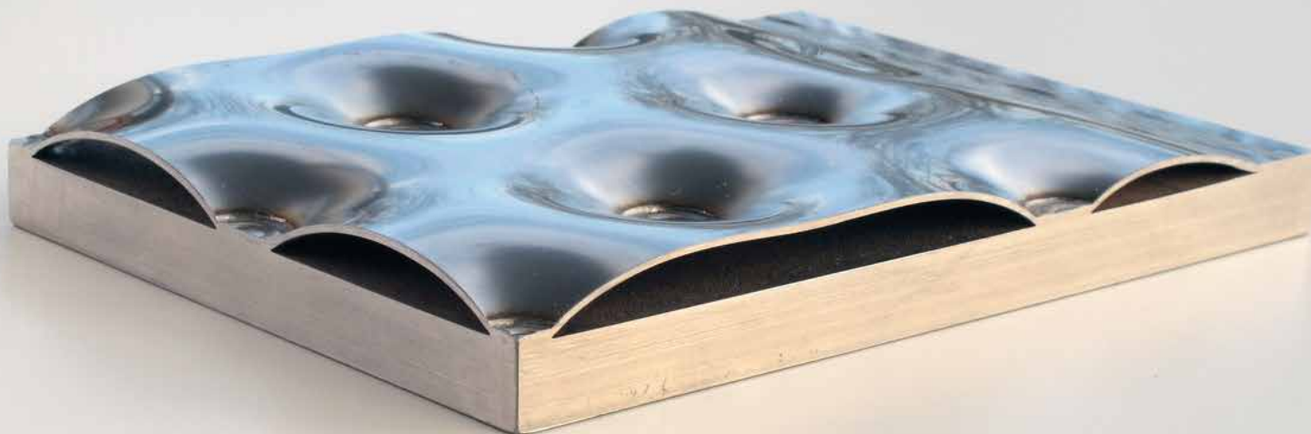
Basis of a tank wall: single embossed heat exchange panels