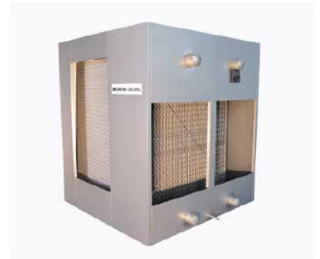
Left to right: BUCOdelot compact system with tank, power 100 kW - dx; BUCOdelot typ M, power1000 kW; BUCOdelot typ B, power 2000 kW